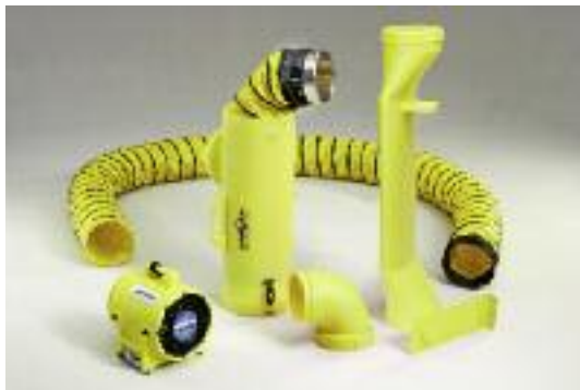
See page 12 for conductive M.E.D.™ System